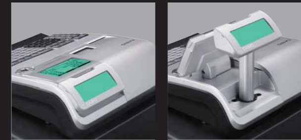
Large popup display

Character display and pop-up capability ensure easy readability for customers. Mistake-free register operation fosters customer trust and increases shop credibility.