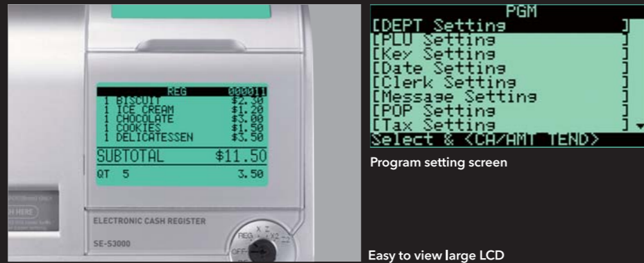
Program setting screen

The displays were designed to maximize viewability and ease of use. Ten-line display capability facilitates input and confirmation during checkout and register setup operations. And, the displays feature a tilt mechanism that permits angle adjustment and are backlit for accurate operation even in dark shop interiors.