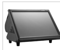
Compact and small footprint