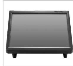
15" TFT-LCD Touchscreen