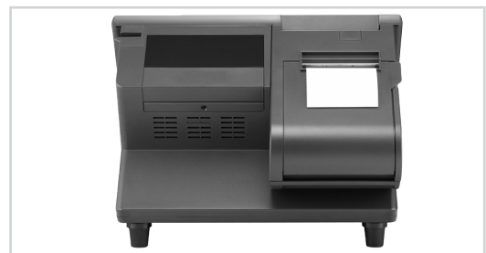
80mm Epson thermal printer with auto cut and paper feed