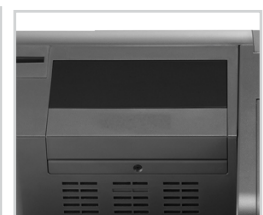
Rear VFD customer display